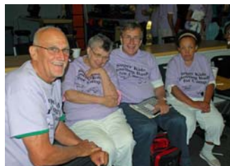
Super Kids Outreach July 23, 2016 from 12:00-5:00pm The Bowling Alley 2237 Boulevard Colonial Heights, VA