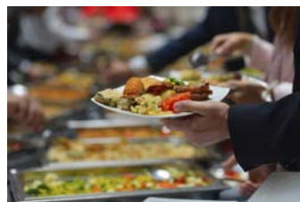
Shepherd’s Luncheon July 17, 2016 @ 12:00pm WPC Fellowship Hall