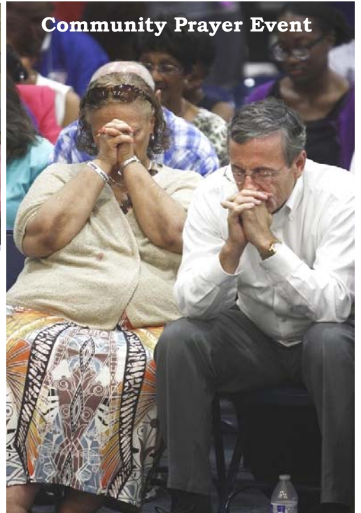
Community Prayer Event