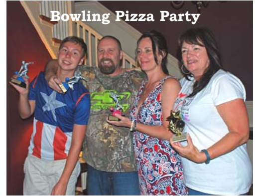
Bowling Pizza Party