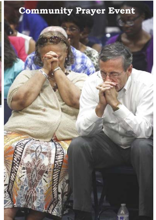
Community Prayer Event